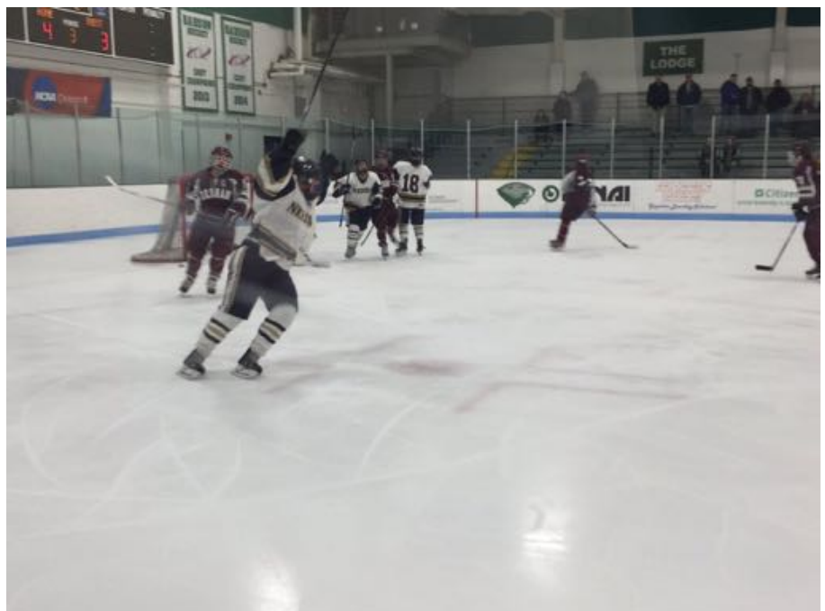
Hernberg celebrates a 3 rd period goal against Dedham